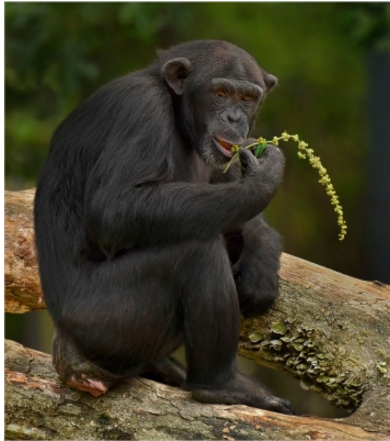
Chomping Chimp - Image of the Year 2025 Class AA 1st Place Open