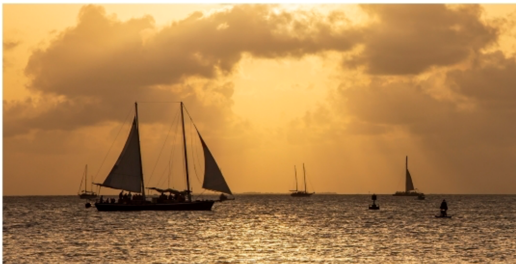
Boats at Golden Hour Key West

Link to the club website calendar for all deadline, program, and competition dates: AVCC Calendar