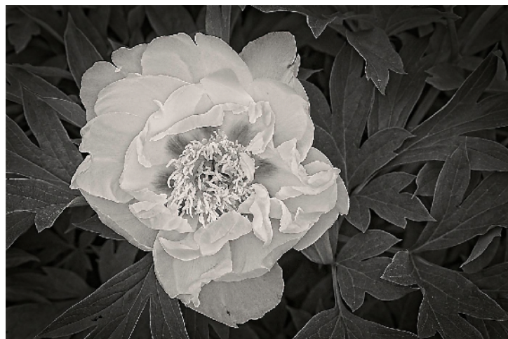
Yellow Peony - Neil Swinton