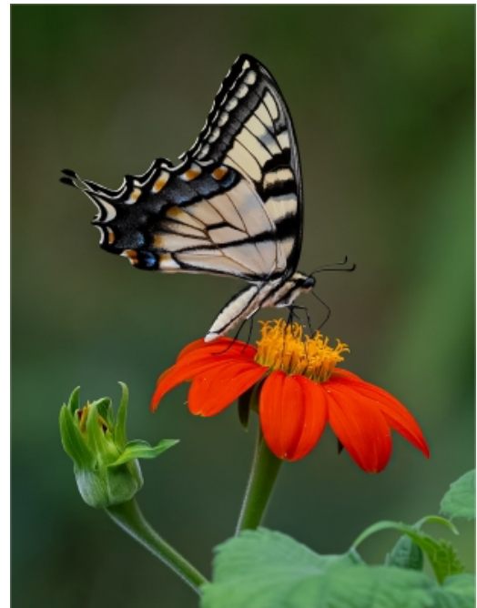
Swallowtail Feeding