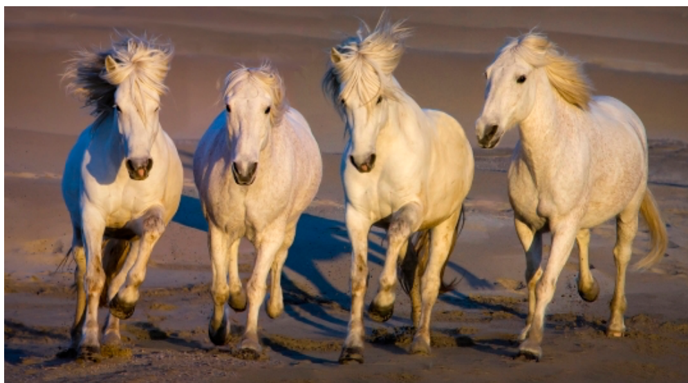
Four Camarque Stallions - Blair Boudreau Image of the Year 2025 Class B Open 1st Place Class B Best in Class