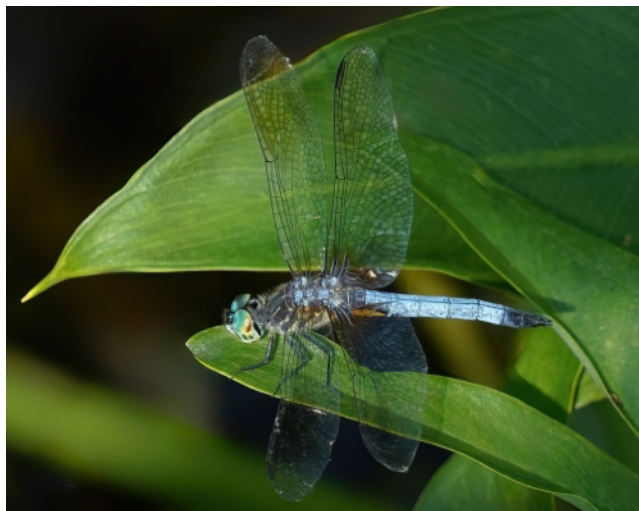
Blue Eyed Darne - Sheri Craig Image of the Year 2025 Class B 1st Place Nature

2024 - 2025 Image of the Year Awards - continued from page 6