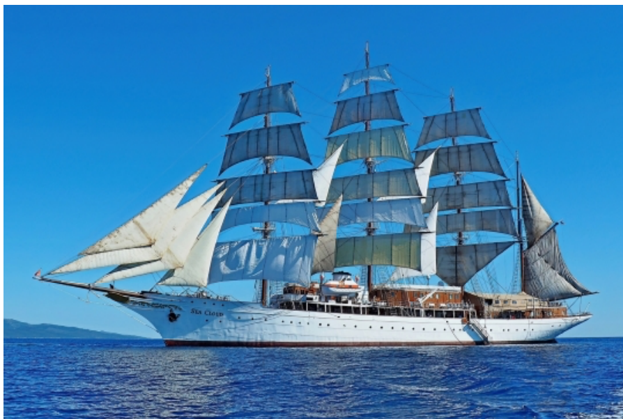
Sea Cloud - Glenn Fund Image of the Year 2025 Class A 1st Place Theme