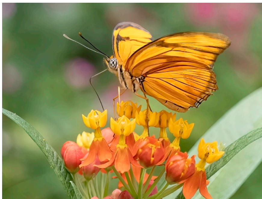
Julia Butterfly sipping nectar - Sue Abrahamsen

To access the issue containing the desired Tips go to the AVCC website and click on the Focal Point Newsletters tab and then click the Focal Point Newsletter Archive link.