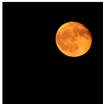
Orange Moon - Lynn Kerner

Lynn was able to capture this image of the Strawberry Moon as it was just beginning to wane on June 12.