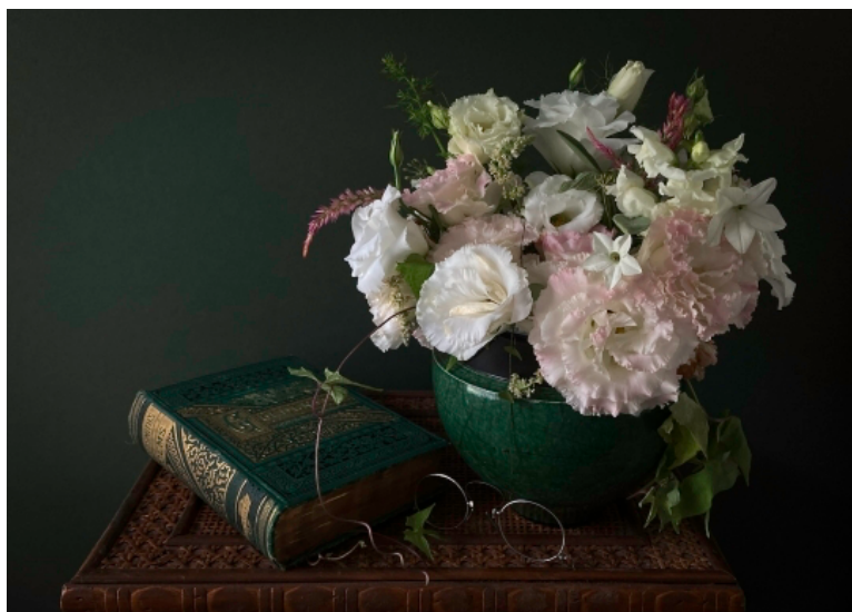
Lisianthus and Goldsmith 3 - Mary Coombs Image of the Year 2025 Class A 2nd Place Open