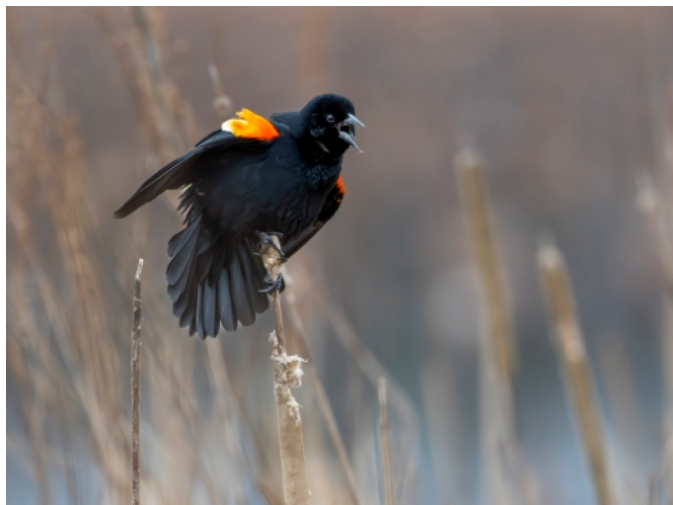
Blackbird Singing - Blair Boudreau Image of the Year 2025 Class B 3rd Place Nature