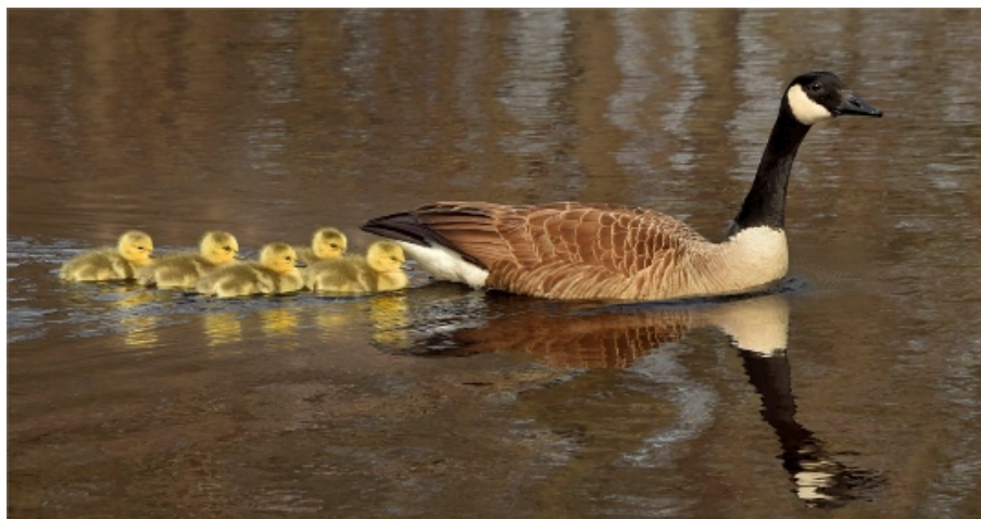
The Swimming Lesson - Doris Monteiro Image of the Year 2025 Class AA 2nd Place Theme