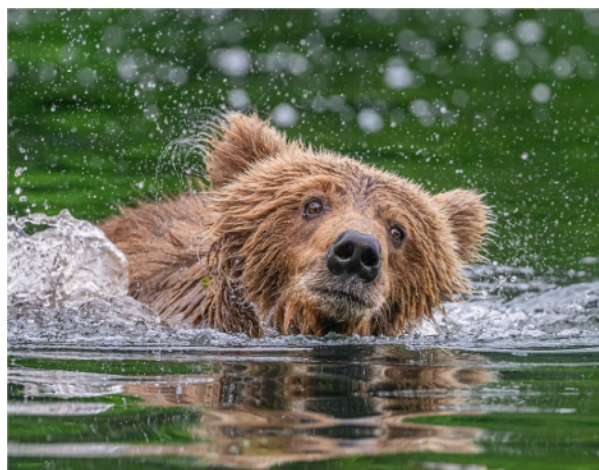
Grizzly Bear Plunges into the Creek

Look for emails to find out what is happening at Cafe 641 later in the summer!