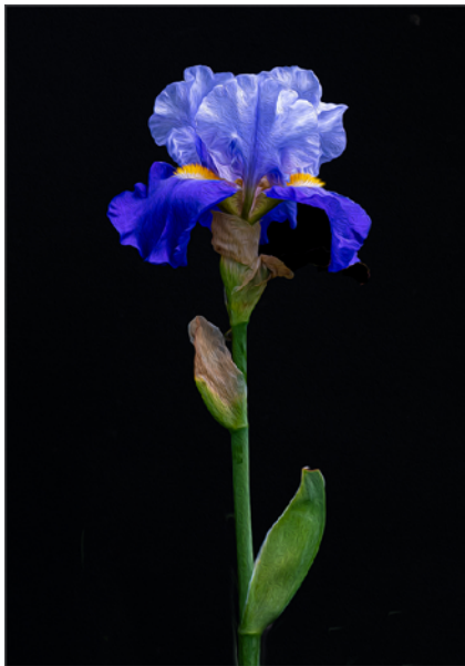
Bearded Iris #15 - John Gill

Some members of the newly formed Bugs and Blooms group met at Tower Hill on the morning of June 1 to photograph - you guessed it - bugs and blooms. Here are some images they shared: