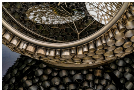
Abstract - Blair Boudreau Image of the Year 2025 Class B 3rd Place Theme