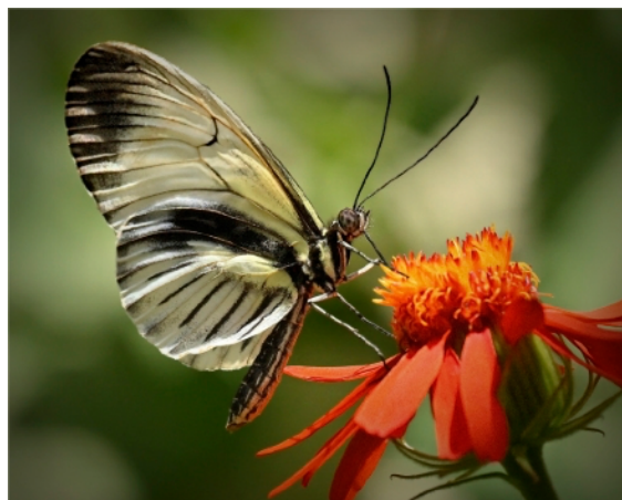
Piano Key Butterfly Nectaring - Tony Monteiro

To see all the scores in Class AA, A, and B go to the AVCC website/Competitions/Digital Results .