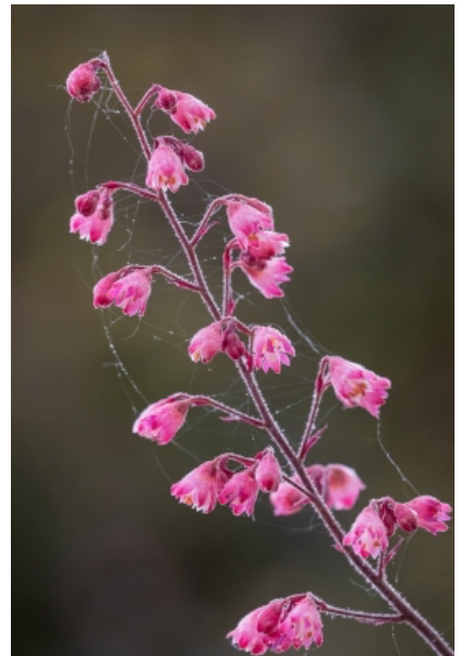
Pink Flowers with Web - Todd Mathieson