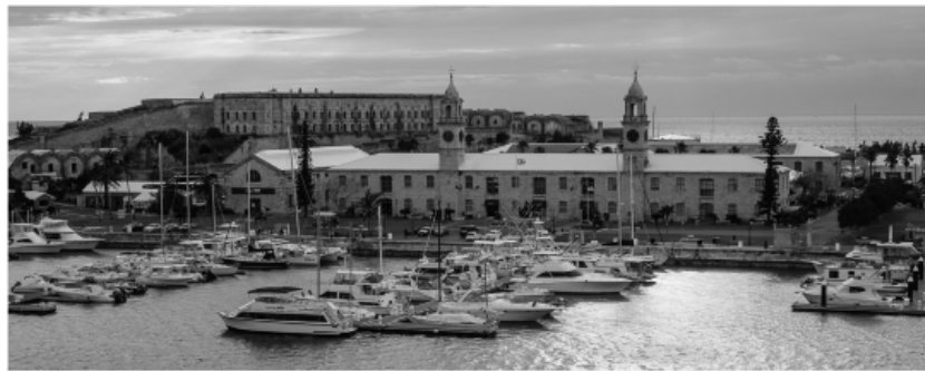
Twilight - Royal Navy Dockyard - Theresa Vachowski

Here is a link to a Bay Photo blog post that may interest you: Honoring the Hard Work of Iconic Professional Photographers