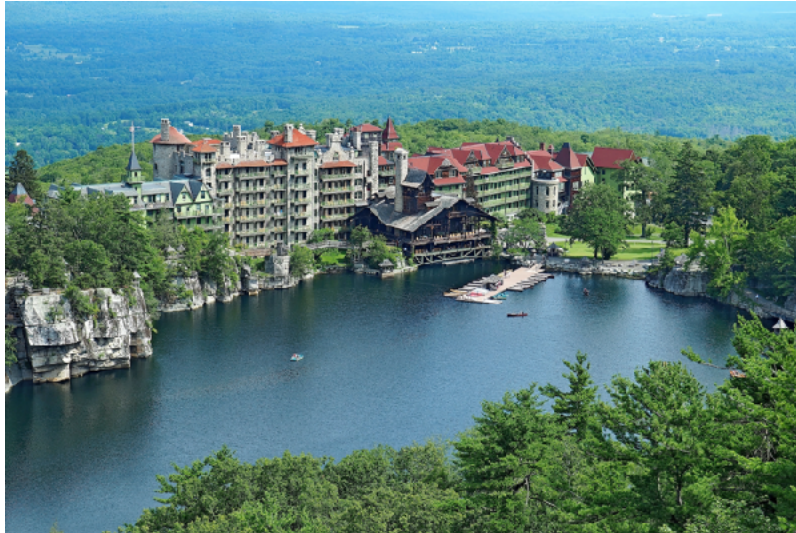
Mohonk Mountain House on our 45th Anniversary!

We asked members to submit one favorite photo from this summer that captures their adventures or maybe something new or something they learned this summer. Here are some beautiful and fun images several members submitted. Enjoy!