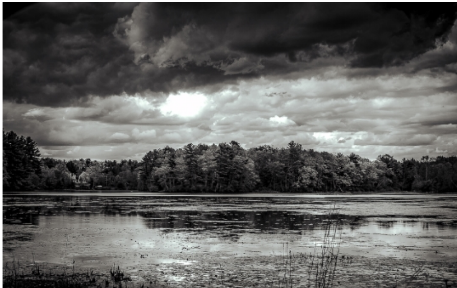
Bartlett Pond - Liz Krouse

Sources: Masterclass.com, Adobe.com, Alphauniverse.com, Improvephotography.com, Studiobinder.com, Imaginated.com, Adorama.com, Iceland-photo-tours.com, Colesclassroom.com, Shotkit.com, Expertphotography.com, Imageexplorers.com.