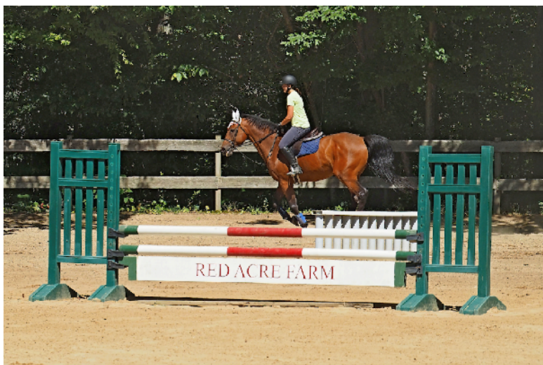
In the Paddocks at Red Acre Farm - Glenn Fund