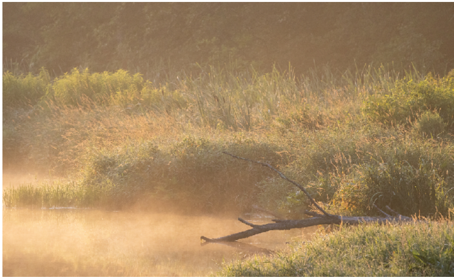
"Summer Morning, Mist on the Assabet" - Lou Snitkoff

Zooming in - Summer - continued from page 15