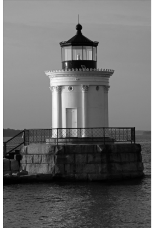
Bug Light, Portland