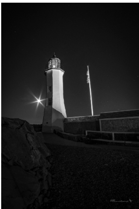
Scituate Lighthouse

"I could never in a hundred summers get tired of this." - Susan Branch