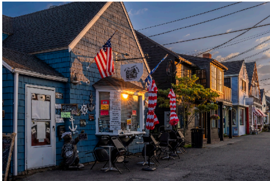
Rockport Morning - Blair Boudreau

Having just moved to Hudson in April, I am beginning to explore the beautiful natural places in our area. This part of the river is so peaceful. - Lou