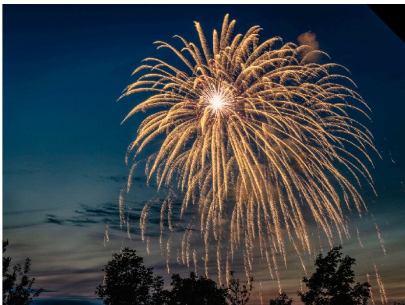
July 4th - Rick Beauchamp

Zooming in - Summer - continued from page 16