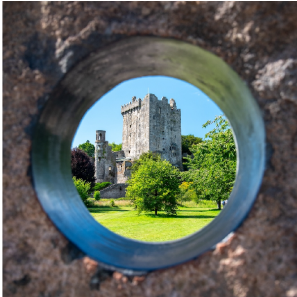
Blarney Castle