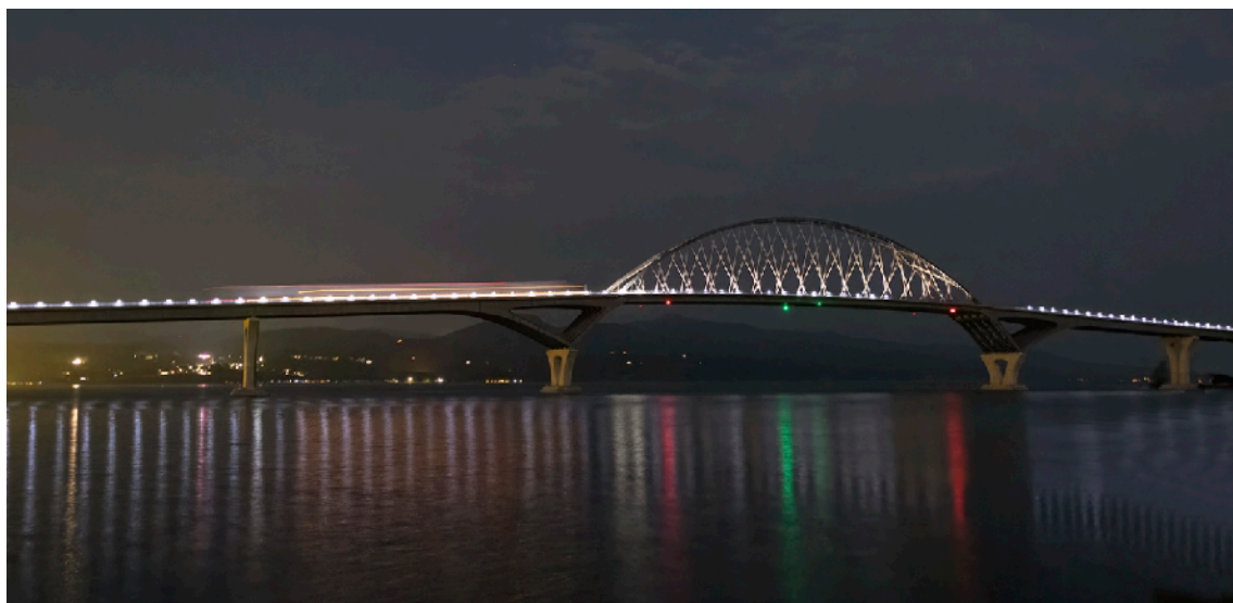
Lake Champlain Bridge - Lynn Kerner