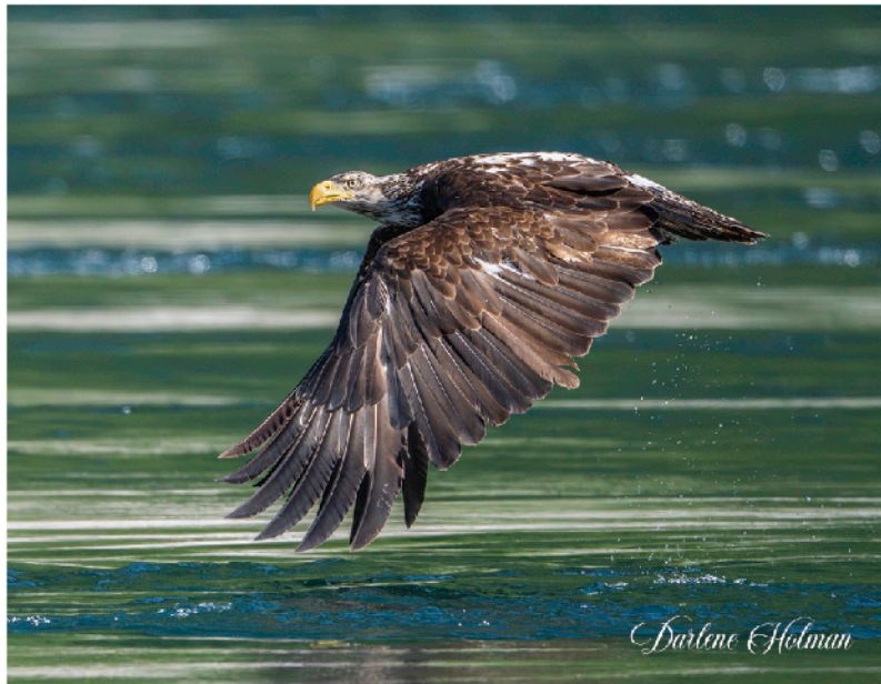
NL Eagle Glacial Water - Darlene Holman

This is a photo from my trip to the Discovery Islands, BC, with Mark Smith Photography in July. It pictures a juvenile eagle on beautiful, colored glacial water.