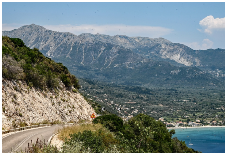
The Road to Vasiliki - Catherine Robotis

This summer, we visited the beautiful island of Lefkada, Greece. Vasiliki is a seaside village on Lefkada that is very popular with the international wind surfing community. This photo was taken from a vantage point overlooking the tranquil sea with the village and mountains in front of us. Looking the other way, I could see the islands of Ithaca and Cephalonia in the distance. It's a happy memory of a perfect day, capped off with a perfect swim, followed by a memorable evening. - Cathy